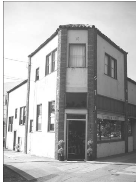
The Rossi building

Rossi Building , 11201 San Pablo Avenue. An early 20th century commercial building. One of several retail and office buildings that remain relatively intact from El Cerrito's early days. The Rossi family rented out the ground floor and lived in the back. The upper floor was "Rossi Hall", where many meetings, weddings, receptions, and other events took place over the years.