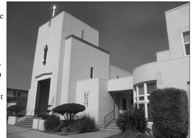
Saint John the Baptist Catholic Church

El Cerrito Public Safety Building . 10900 San Pablo Ave. Attractive modern ranch styling in this 1959 building designed by architect Milton Pflueger. Next door is City Hall at 10890 San Pablo Avenue. This 2009 neo-Craftsman style building by BSA Architects is a green building with natural lighting, radiant