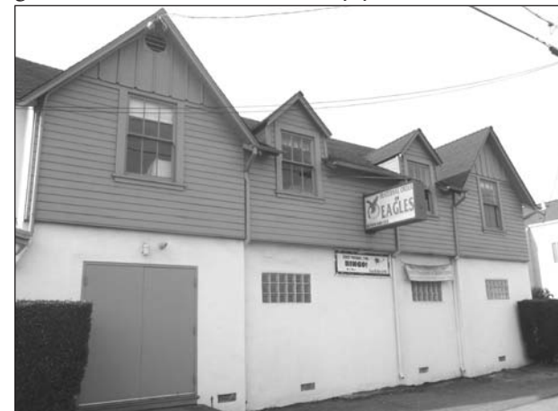
Eagles Hall, formerly the famous "Wagon Wheel"