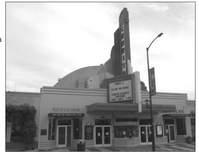
The Cerrito Theater