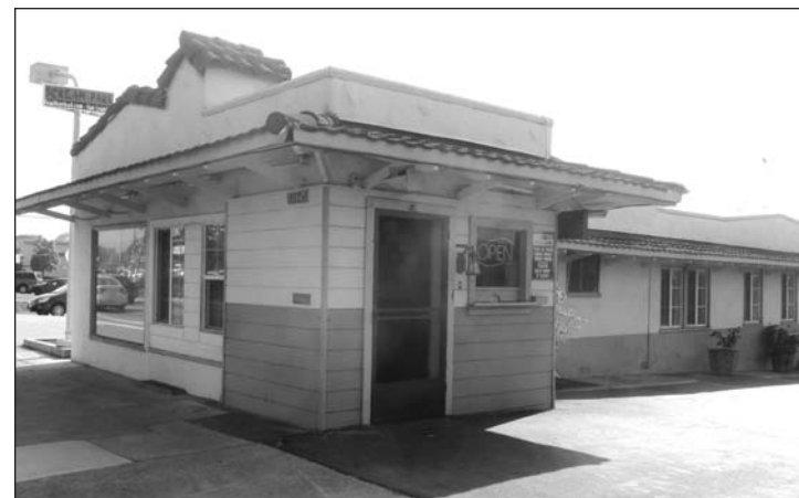
The Freeway Motel

Avenue. It began in 1931 as roadside cabins that catered to travellers on US 40. It is one of the earliest such travelers' accommodations in the area. Expanded over the years, the current structure went up about 1951.