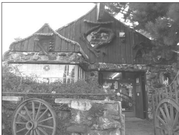
The Old West Gun Room

dustry workers, and the El Cerrito Motor Movies, a drive-in. El Cerrito Plaza opened in 1958, two years after the adobe was destroyed by fire.