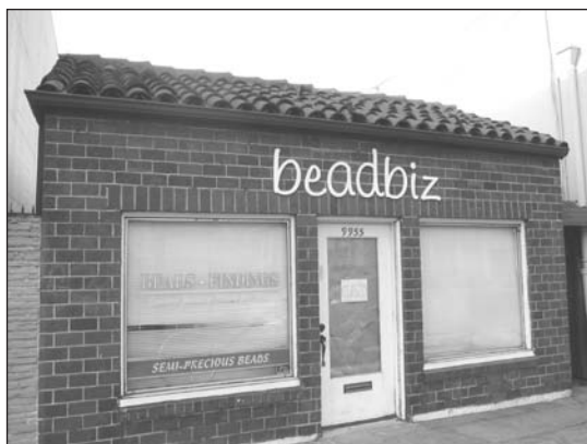
The former County Line Cleaners shop

El Cerrito Plaza BART Station. Both of the two El Cerrito BART stations were designed in 1969