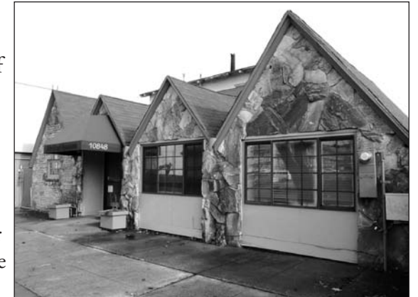
The Mabuchi family’s Contra Costa Florist shop

Former Hillside Inn , today Hillside Garden Apartments. 10701 San Pablo Avenue. This picturesque former inn (now apartments) was originally the Stag House, circa 1912, and later the La Vyra Inn. A recent remodel altered some of its exterior fabric but it still recalls the old days.