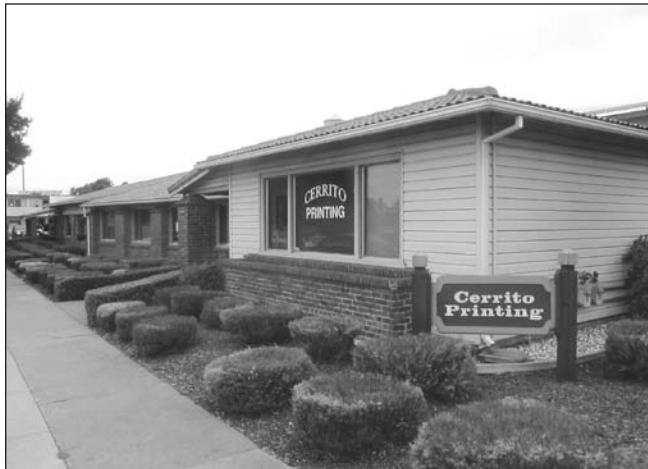
The former Cerrito City Club

Former Poloni's Market , now Giovanni's Produce . 1600 Liberty Street. Unpretentious, though not unprepossessing store that recalls the days when this district was Little Italy. Originally the retail outlet for Baroni bakery faced onto Liberty, with the bakery in a separate building in back.