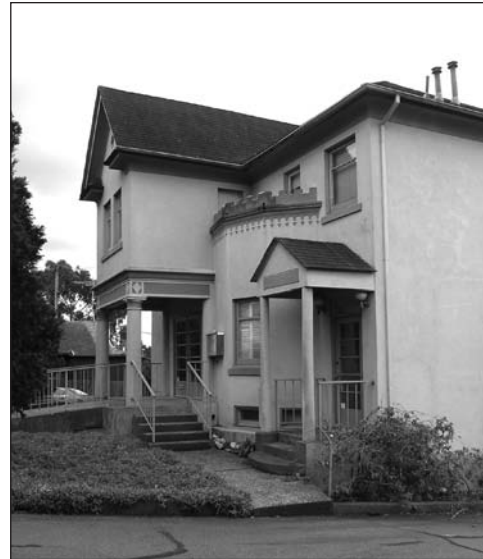
The Allinio house

Historic bungalow , 10152 San Pablo Avenue. One of a handful of early 20th century homes on the Avenue that retain their original appearance. Circa 1916. House shows typical dual-gable look of California bungalow.