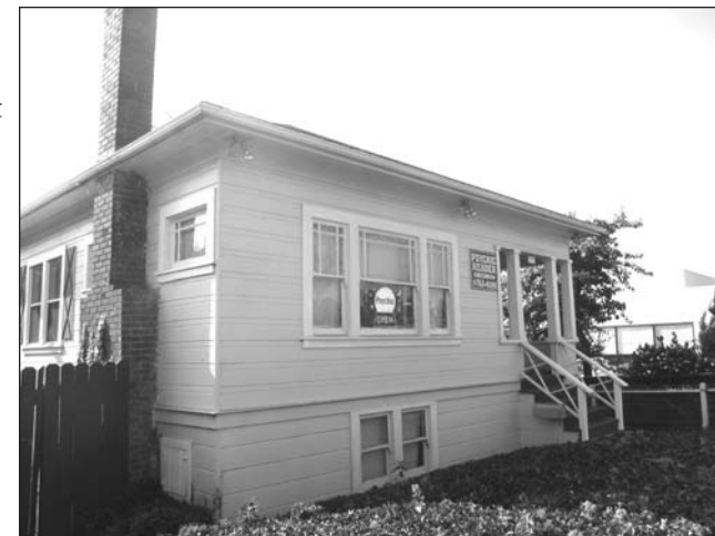
11471 San Pablo Avenue

Cluster of early 20th century houses. 11453, 11457, 11471 San Pablo Avenue, all circa 1905-1915. All of these building were at one time private homes but some of them have now been converted to shops.