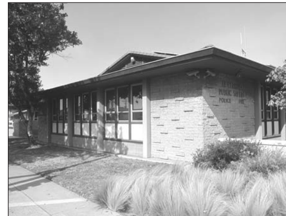
El Cerrito’s Public Safety building