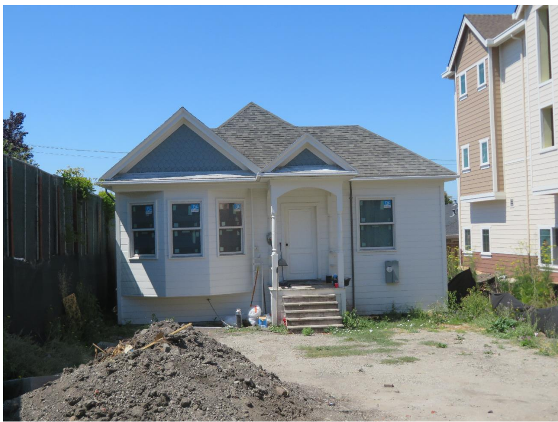
The Rodini house is a small Victorian cottage. The society succeeded in convincing city officials to ensure its

preservation while new residences were built alongside.