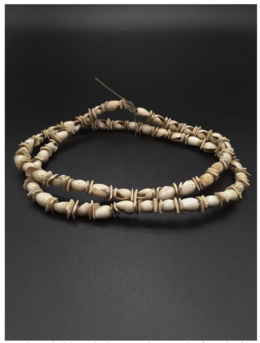
This Native American shell bracelet is among items stolen from the Alvarado Adobe Museum.

Tragic theft decimates collection at the Alvarado Adobe Museum . This <u>historical museum</u>, operated by the San Pablo Historical and Museum Society in a recreated Colonial-era adobe owned by the city of San Pablo, has been burglarized. Much of its irreplaceable collection was stolen, including rare Indian artworks and other artifacts.