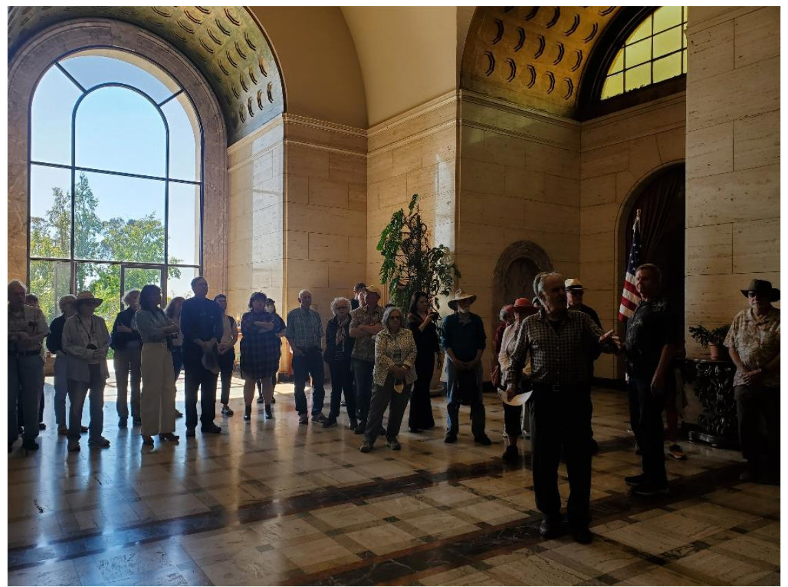
On August 18, a Friday afternoon, about 45 people enjoyed a tour of the Golden Gate Mausoleum in Kensington,

Golden Gate Mausoleum tour proved popular and enlightening. About 45 people attended this society tour of the former Sunset Mausoleum, built starting in 1927 and hosted by the mausoleum and its new owners, some of whom also attended.